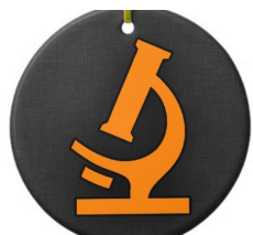
Harmony Scientific Research Society

Harmony Public Schools have long been a pioneer in STEM education across the nation. Center for STEM Education has been established to coordinate the efforts of creating high quality STEM programs and to make our vision of leading our students into the world as STEM advocates and even Nobel laureates a reality. Center for STEM Education now presents Harmony Scientific Research Society ... a society of integrity and science...the national honor society of advanced research in science and engineering. It is more than an honor society where members will come for the honor but stay for the opportunity to serve. This Harmony-wide research society will be recruiting students who are dedicated to making a difference in STEM, and they will be members of a society of Nobel laureates. Apply today to join this prestigious community of student researchers across Harmony Public Schools.